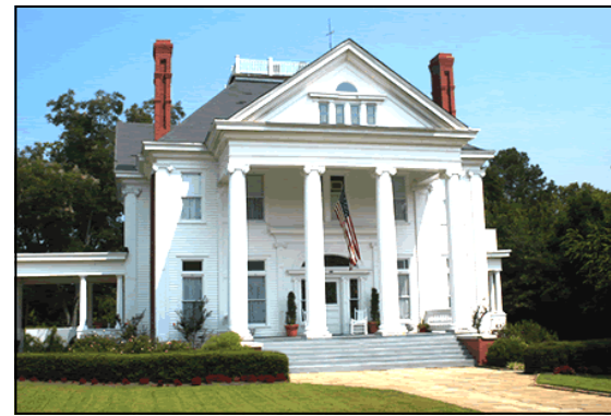
Bellevue Avenue The Page House

Welcome to Dublin, "The Emerald City," in Laurens County, where small town Southern charm and a determination to keep Dublin-Laurens County "Green and Growing" have combined to create a community rich in character and full of life.