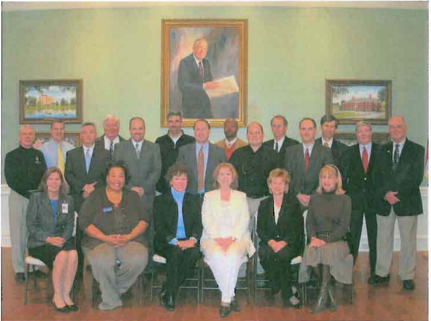
2007-2008 Chamber of Commerce Board of Directors